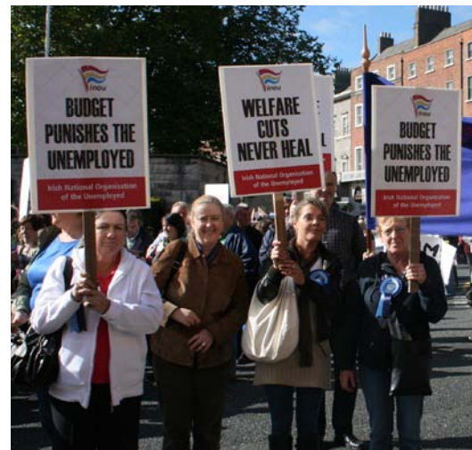
INOU staff at SIPTU march in September 2009

The third report NESC published was its first social report entitled "Well-being Matters: A Social Report for Ireland" (NESC 119, October 09). Work on this report had commenced in 2008 but had been pushed back because of the economic reports.